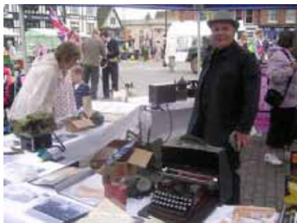
Stalls on the Market Square and stirring the memories of older people at the Step Out Club.